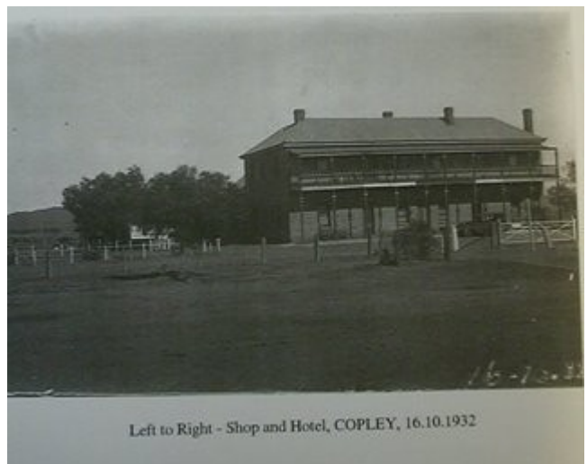
Lewis' hotel and shop in Copley which is near Quorn, South Australia